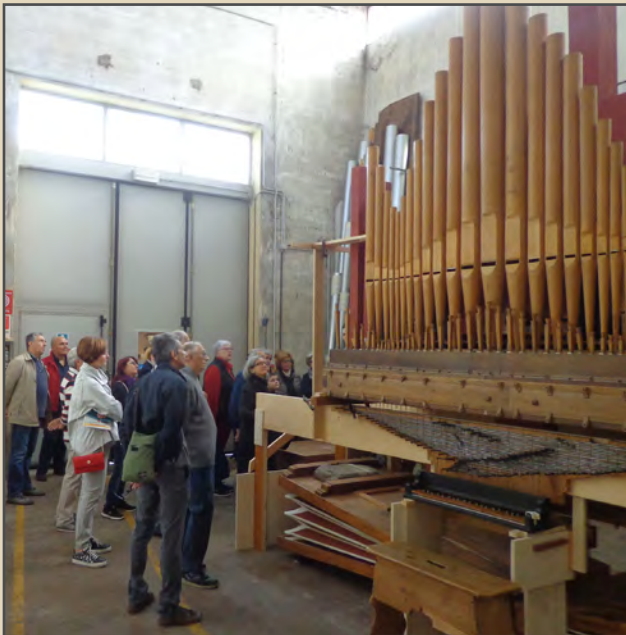
The unique and ancient “wooden organ” of Fusine