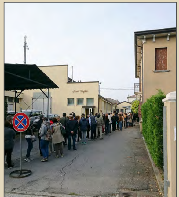
The long line of visitors extends all the way to the street.

On Sunday, October 13th, the factory was open for guided tours from 10:00am until 6:00pm. Trained guides were at the ready to walk visitors through the entire process of making a pipe organ. Then, something unexpected happened: people started lining up from early morning to register for the visit. Many of them came from very distant locations. At the end of the day, more than 600 visitors were able to take the tour, only a portion of the many more who showed up.