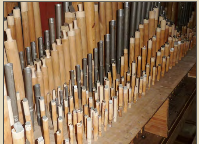
Inside the Fusine organ

The restoration of the “wooden organ” of Fusine, an instrument which is quickly becoming world-famous, was near completion, and the visitors were able not only to see it but also to hear its incredible sound. Most of the pipes of this organ, built around 1810, are hand carved in cylindrical or conical form from spruce and maple, from the large façade pipes down to the smallest pipes of the ripieno. Some of the wooden pipes are smaller than a pencil, hand carved with the utmost precision by Agostino De Marco as an imitation of “normal” metal pipes. The several hundred such pipes make this instrument unique to the world.