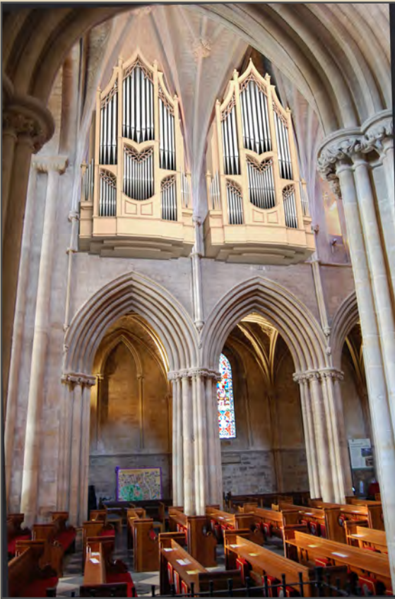
At left, a computer image of the new Ruffatti pipe organ at Pershore Abbey, featuring two side-by-side oak cases. At right, a detail of the case, with its hand-made carvings and the embossed central pipe.