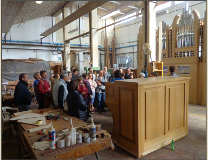
Visiting the woodworking department

Visitors were divided in small groups and at each “station” FAI volunteers were ready to explain the manufacturing procedures. The photo at right shows one of a set of twin consoles, part of an organ which will soon be delivered to a church in Pennsylvania. In the background, a portion of the organ façade is visible.