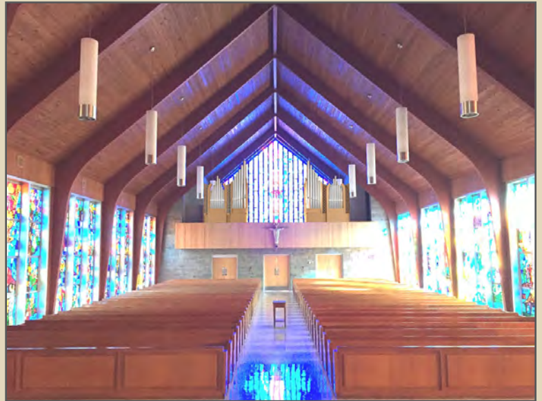
The rear balcony with the computer image of the new instrument

The organ design for St. Katharine of Siena complements the interior architecture of the church without creating overly ornate or heavy-looking elements.