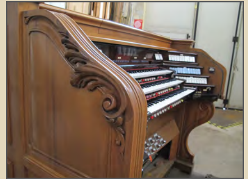
The hand-carved solid walnut console cabinet

The beautifully built console has been brought back to the workshop and a new operational system has been installed, which will expand memories and provide additional features.