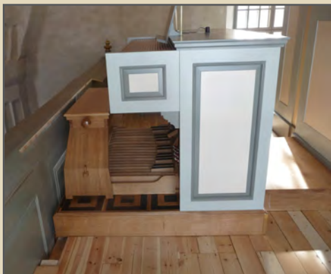
Above: The detached console.