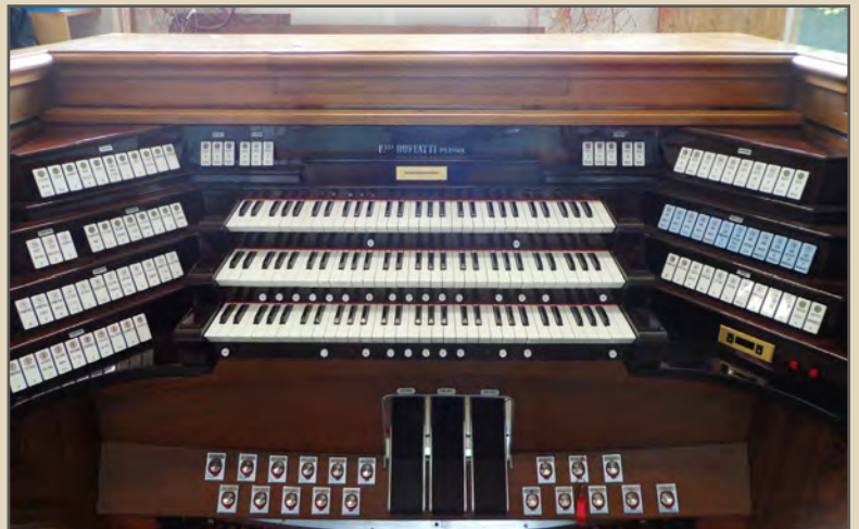
The renovated console interior