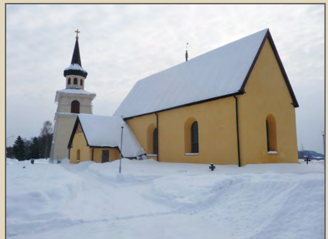
Up to five feet of snow welcomed the installation and voicing teams at Boteå Church in March of 2018.

The tonal composition of the instrument, along with the versatility of voicing, allows for the performance of a surprisingly broad repertoire. The instrument has been very well received by organists and church members alike.