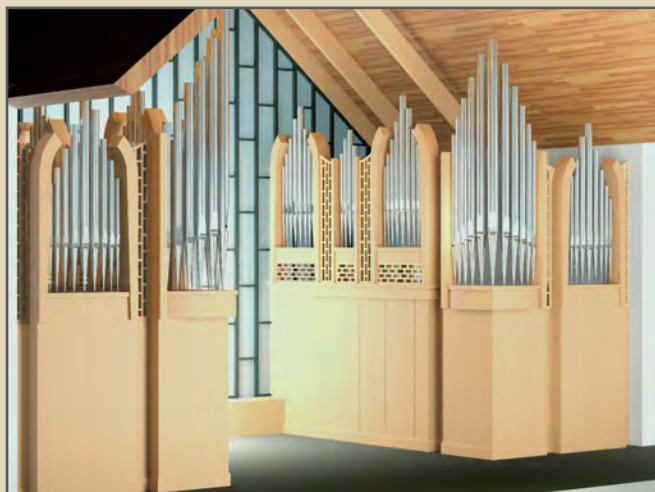
Side view of the oak case