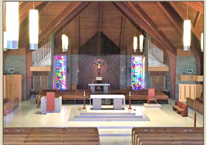
The Positiv division in front