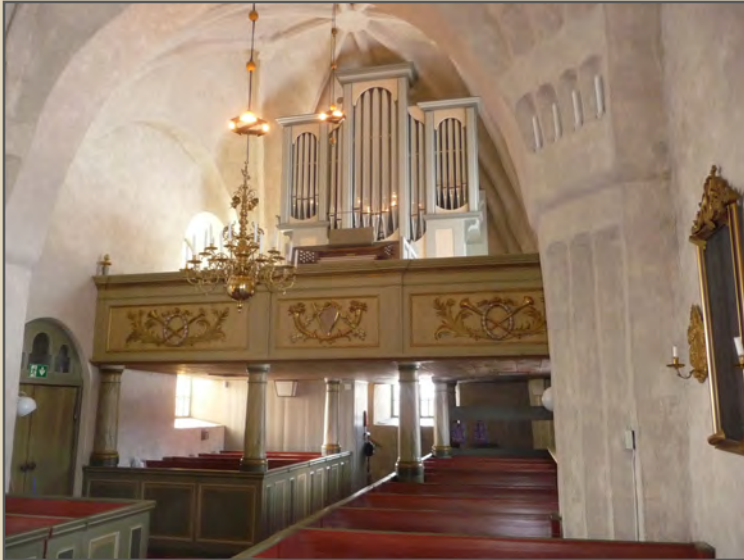
The new mechanical action organ in Boteå Church, Sweden.