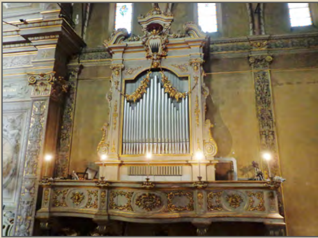
One of the two organ façades

After half a century of intensive use, the large three-manual organ in the Cathedral of Ferrara, in northern Italy, is undergoing a renovation. It was originally installed by Ruffatti in 1967, and the time has come for a complete check-up and technical update.