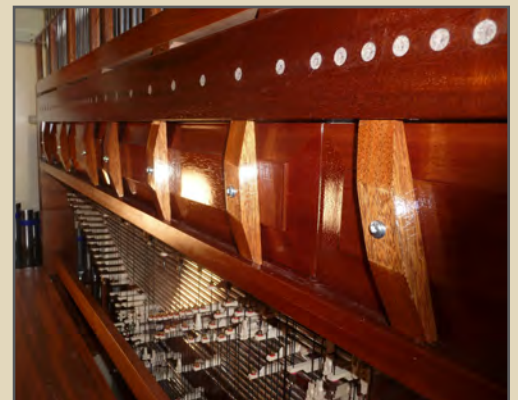
African Sipo mahogany windchest and rollerboard