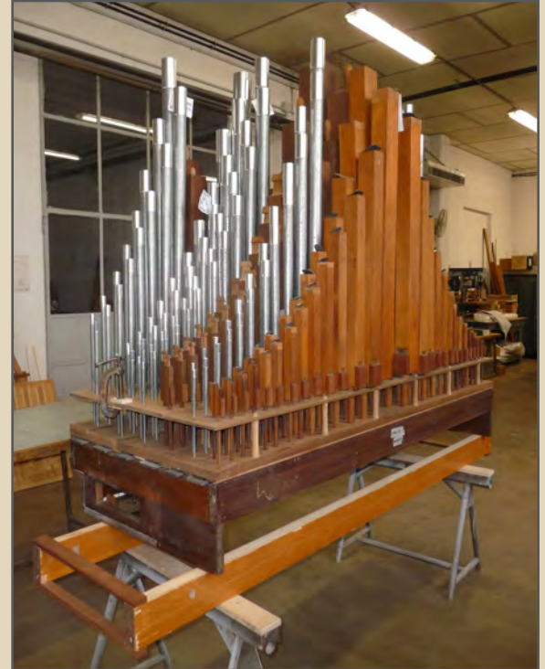
Above: Console detail. Right: Testing a Swell windchest