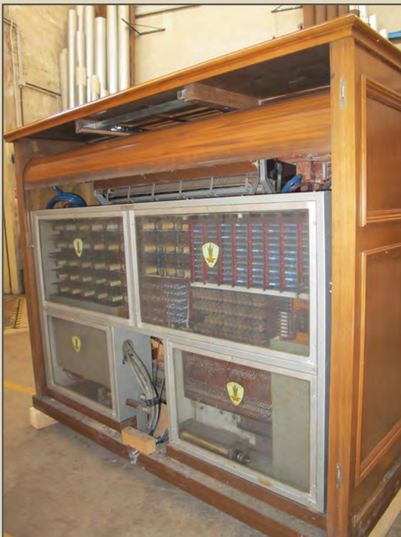
The original interior mechanisms of the console, all manufactured in house and sealed under glass.