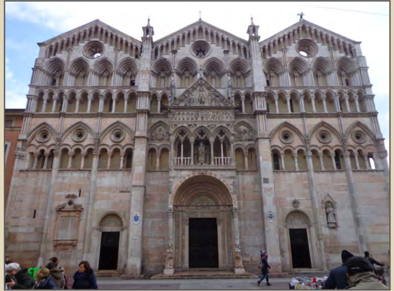
The white marble façade of the Cathedral of Ferrara, built in the twelfth century

The beautifully built console has been brought back to the workshop and a new operational system has been installed, which will expand memories and provide additional features.